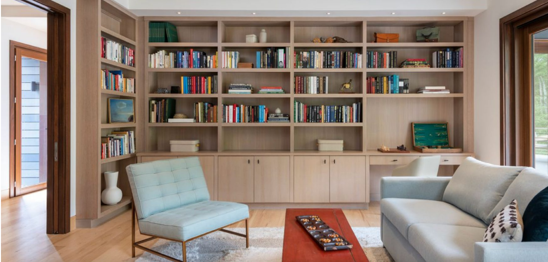
The library has built-in bookshelves.