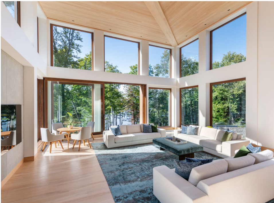
Large windows in the living room provide lake views.