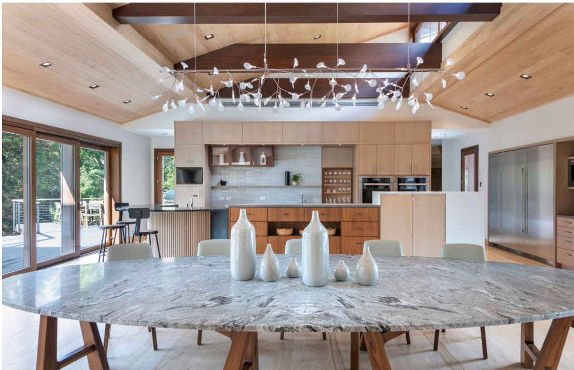
A Moooi chandelier hangs above a custom marble table that can seat 24 people.

From the exterior, the house nestles into the hill above the lake and follows the contour of the land. “The curve holds the house to the land,” Ms. Pavlides says. “It also provides all the rooms with privacy and different views of the lake, since they’re not in a line.” The garage has a green roof that continues the natural look of the landscape.