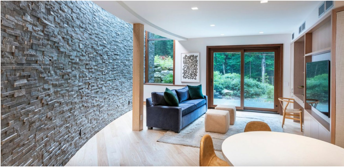
The guest wing includes a 'rumpus' room, which Isobel Martin envisioned as a place to feed and entertain visiting grandchildren.